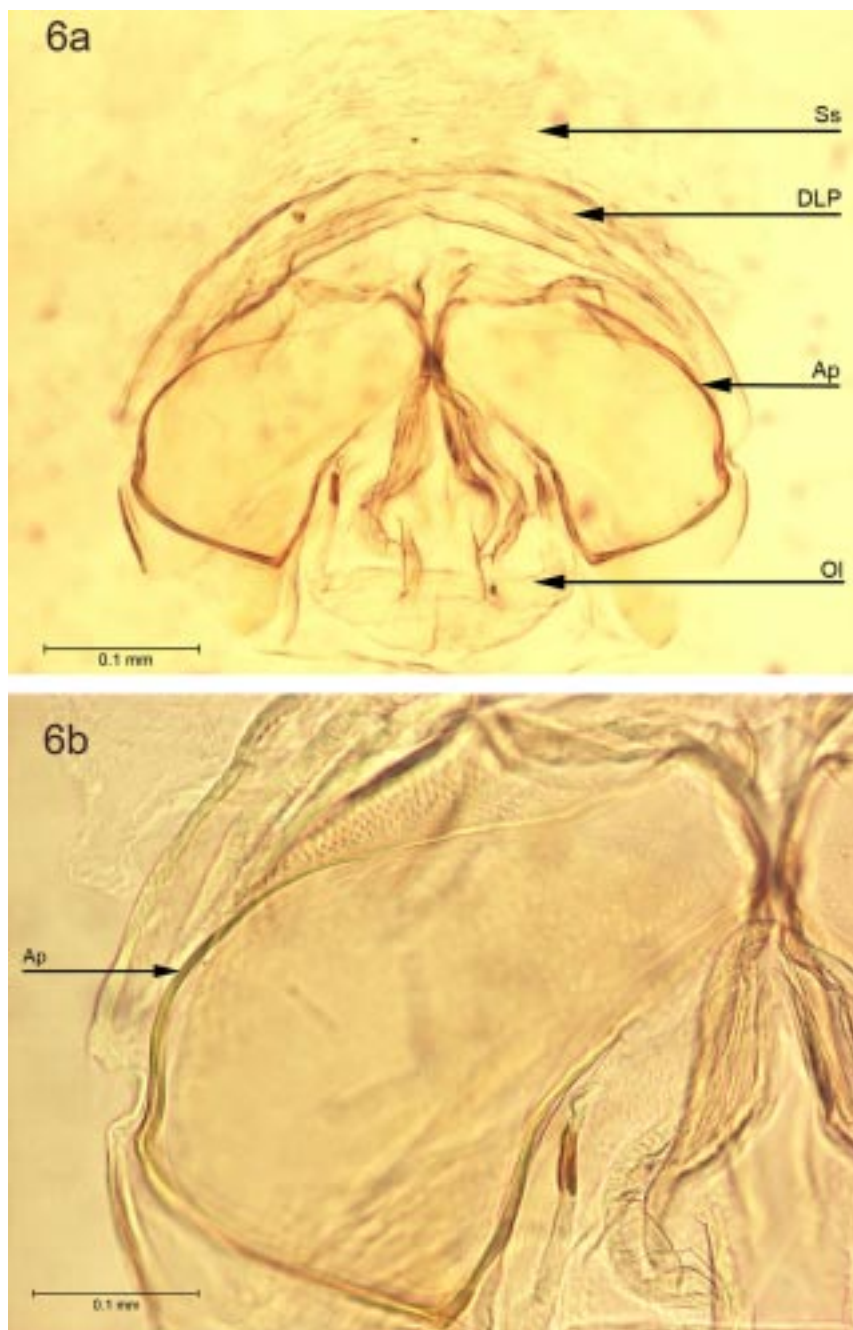
6. Teratofulvius metallicus POPPIUS, holotype, female genitalia. 6a - vagina in dorsal view; Ap: parieto-vaginal rings, DLP: dorso-labiate plate, Ol: lateral oviduct (see description)