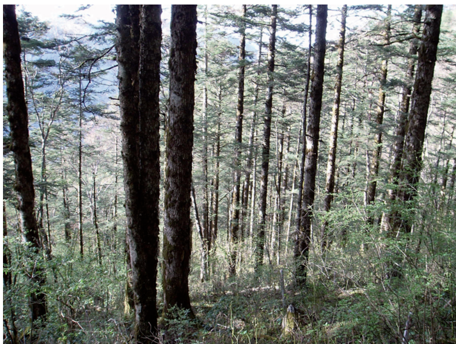
32. A typical section from locus typicus of Tarnawskianus longicornis n. sp., in the Dashennongjia mountains at Hubei, China, on 17.V.2004

Specimen of Borowiecianus alatus has been collected in the Yulongshan Mountains in the Chinese province Yunnan. The specimens have been picked by hand in daylight from lower vegetation at an altitude of 3600-4300 m. The environment of the