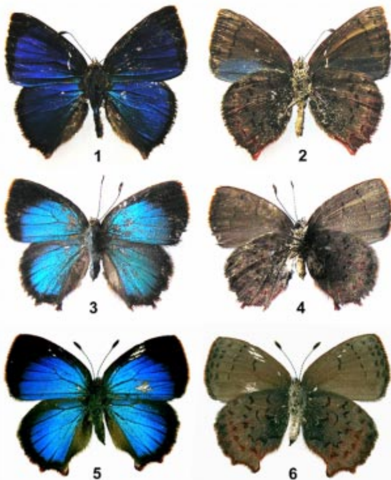
1-6. Rhamma bilix (DRAUDT) adult phenotypes: 1- male, dorsum (Colombia, Valle), 2 - ditto, ventrum; 3 - Neotype female, dorsum (Colombia, Valle), 4 - ditto, ventrum; 5 - male, dorsum (Ecuador, Azuay), 6 - ditto, ventrum

Our Neotype selection is in accordance with the ICZN Article 75. This action is needed because the sex of the species " Thecla bilix " was misidentified, its male has never been described and systematic placement remained unsolved. Therefore, our Neotype designation helps to clarify the taxonomic status of the species and fix the type locality of " Thecla bilix " nominal taxon (ICZN Art. 75.3.1.). Redescription of the species provides characters by which it can be distinguished from other closely related taxa (ICZN Article 75.3.2.). The neotype is documented in colour and its data are precise and sufficient for subsequent recognition (ICZN Art. 75.3.3.). We are deeply convinced that the original, name bearing