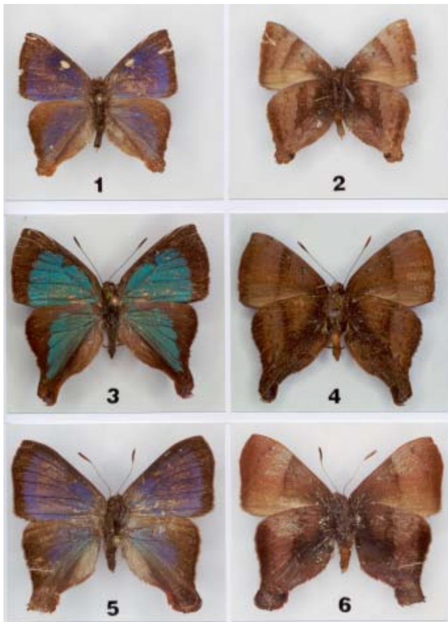
1-2. Pons saraha , male, Ecuador (HNHM): 1 - dorsum, 2 - venter (forewing length 13,5 mm). 3-4. Pons magnifica , male, Colombia (MZJU): 3 - dorsum, 4 - venter (forewing length: 15 mm). 5-6. Pons purpurea , male, Ecuador (NMW): 5 - dorsum, 6 - venter (forewing length: 16 mm)