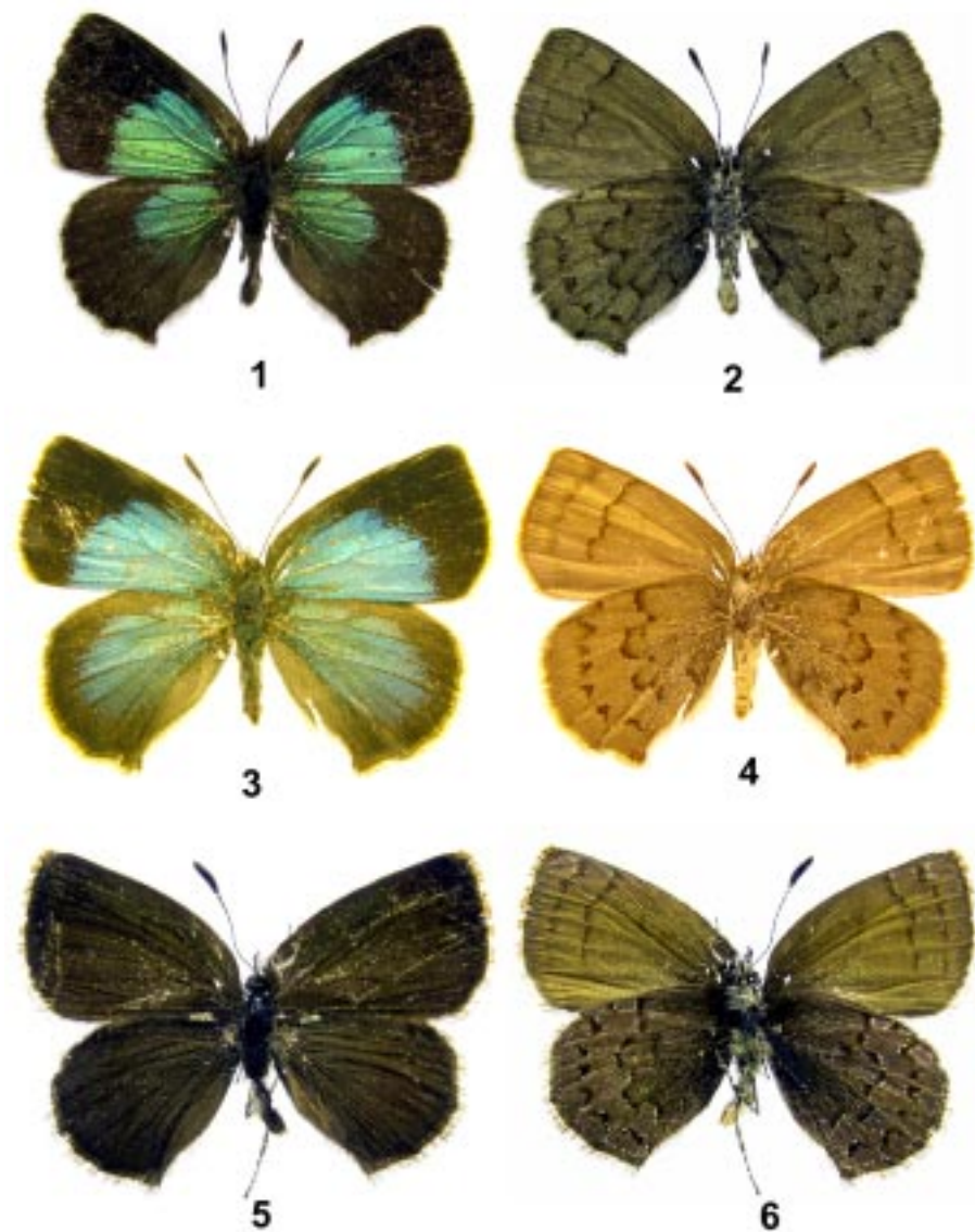
1-4. Podanotum clarissimus HALL, WILLMOTT et JOHNSON: 1 - male, dorsum, 2 - male, ventrum, 3 - female, dorsum, 4 - female, ventrum; 5-6. Podanotum melanissimum n. sp., holotype: 5 - dorsum, 6 - ventrum

ECUADOR: prov. Loja, Saraguro, 3100 m 02.II.2004, leg. Wojtusiak (MZUJ: female), ditto, 3200 (MZUJ: male).