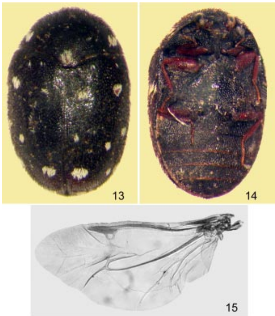
13-14. Phradonoma borowieci n. sp.: 13 - dorsal side; 14 – ventral side; 15 - wing