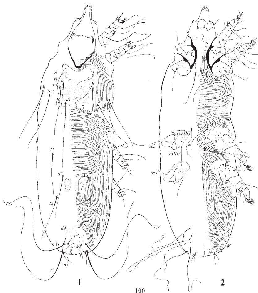
1, 2. Torotrogla modularis n. sp., female: 1 - dorsal view; 2 - ventral view

Male: Total body length 650-670. Gnathosoma : Hypostomal apex ornamented with a pair of short and blunt protuberances (Fig. 8). Each transverse branch of peritremes with 3-5 chambers, each longitudinal branch with 4-6 chambers (Fig. 9). Chelicera,