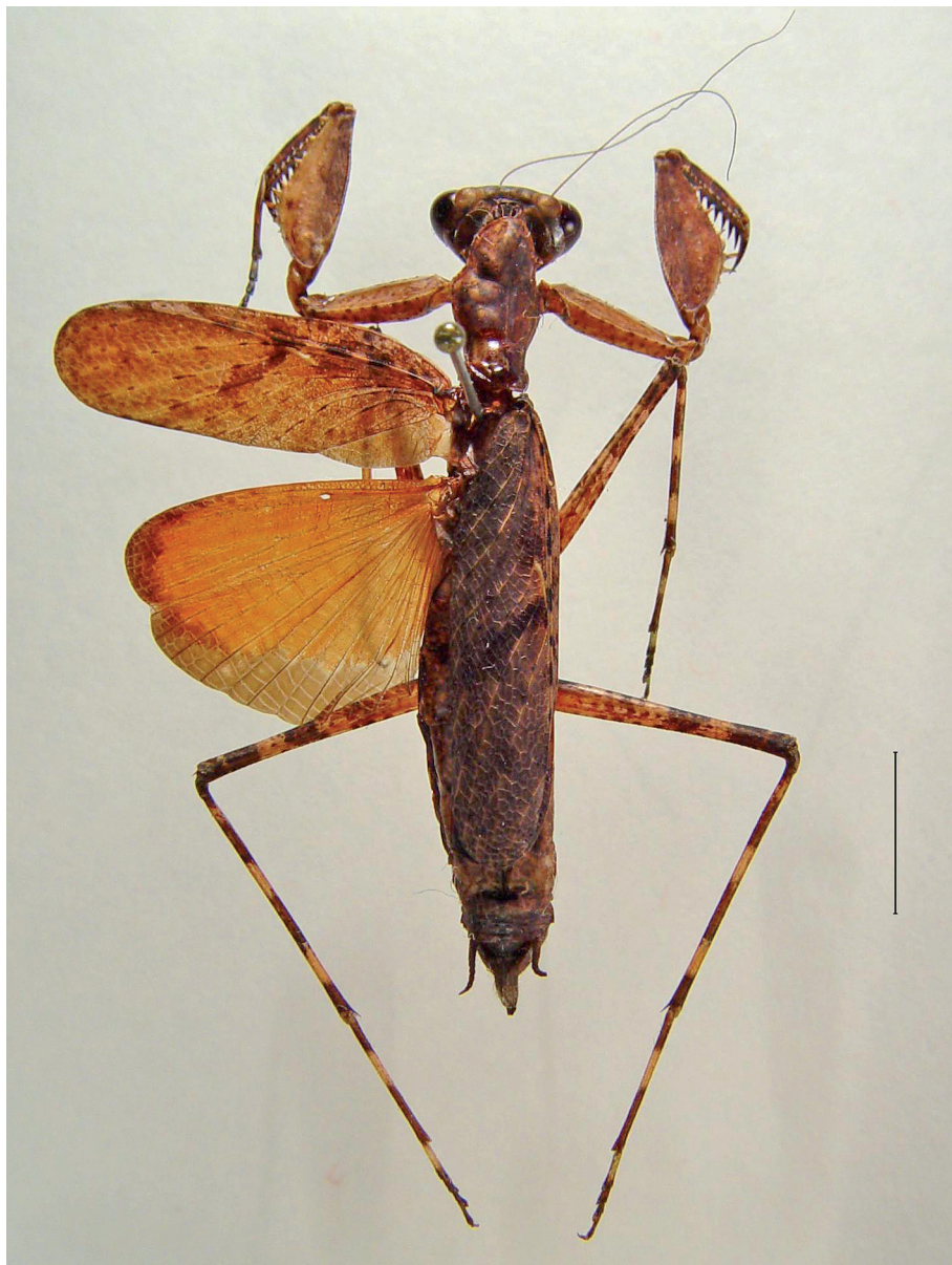
2. Gimantis authaemon (WOOD-MASON, 1882), female from Poormudi Range Kerala, India, habitus, dorsal view. Scale bar = 8.0 mm

Frontal sclerite black in the form a wide transverse patch, upper margin pale brown and widely arched; clypeus concolorous with vertex.