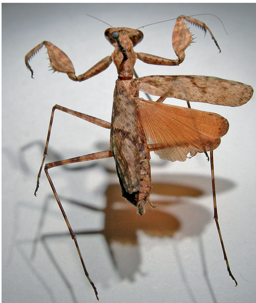
1. Gimantis authaemon (WOOD-MASON, 1882); female, India, Kerala, Aripa forest, dorsal view. Total length 32 mm

Eyes large, rounded laterally and little above level of vertex; ocelli minute. Vertex light brown with faint dark dots, with one median (with a faint median vertical carina)