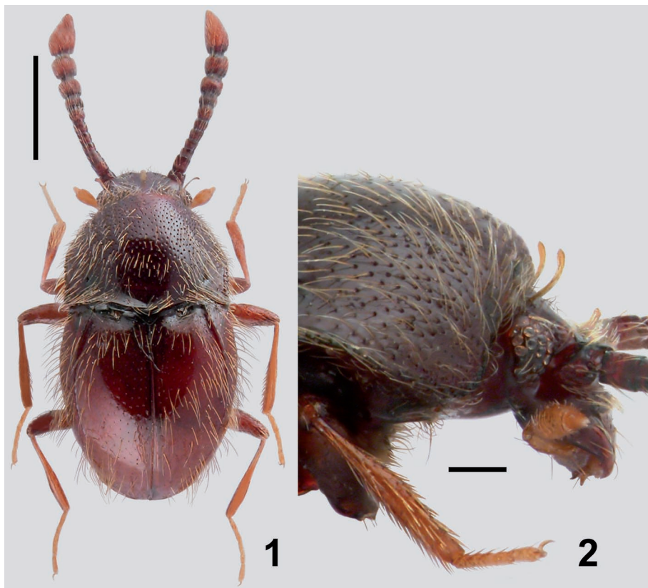
1-2. Cephennodes qionghaoanus sp. nov. Male dorsal habitus (1); head and prothorax in lateral view (2) (scale bars: 1 – 0.5 mm; 2 – 0.1 mm)

Male (Figs. 1-4). Body (Fig. 1) moderately large, length 1.70-1.73 mm, moderately elongate, with very shallow and weakly marked constriction between pronotum and elytra, dark brown, covered with light brown vestiture. Head (Fig. 2) large in relation to pronotum, length 0.23-0.25 mm, width 0.44-0.45 mm; vertex evenly convex, with a pair of long, curved and apically thickened lateral bristles, covered with small and shallow but distinct punctures, in middle separated by spaces twice as wide as puncture diameters, slightly denser on sides; frons with large but shallow median impression between feebly raised supraantennal tubercles, median part of impression with small subtriangular impunctate area bearing median setal brush directed anterodorsally; sides of frons with punctures similar to those on vertex; clypeal region distinctly demarcated from frontal impression by a pair of low lateral transverse protuberances, with punctures slightly more distinct and denser than those on frons and vertex. Setae on head dorsum long and sparse, erect. Antennae slender and compact, length 0.88 mm, with five distal antennomeres covered with slightly coarser microsculpture than