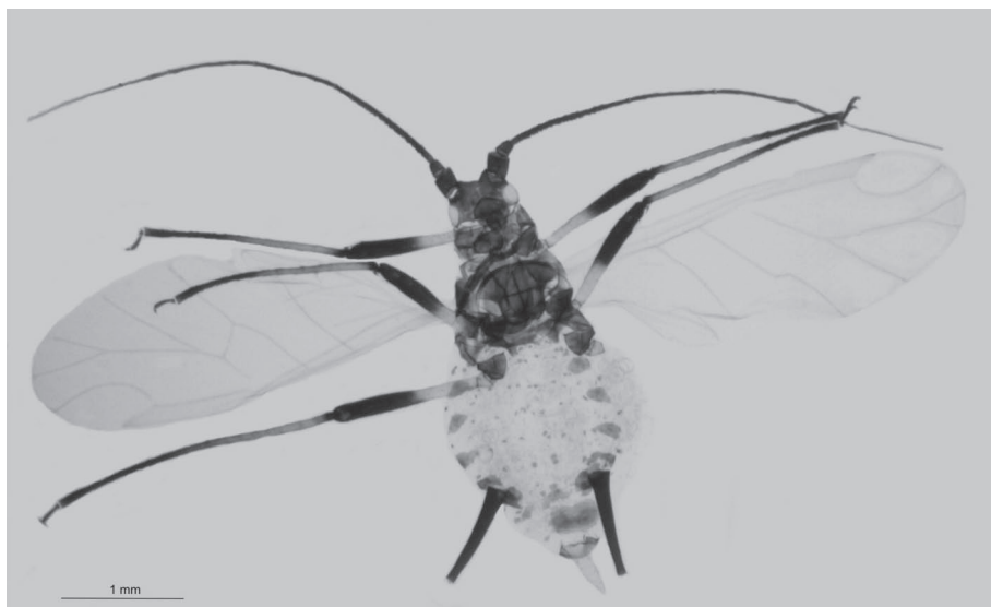
1. The alate morph of U. leontodontis

Apterous viviparous female: body dark brown, shiny, 3.26 mm long; antennae dark, 1.1 x body length, processus terminalis 6.0 x VIa; length of antennal segments VI – I (mm): 1.11; 0.61; 0.63; 0.97; 0.13; 0.16; VIa 0.68 x apical segment of rostrum;