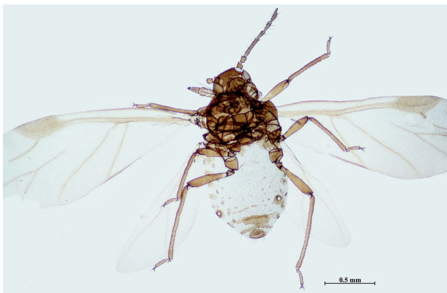
1. Alate fundatrigenia of A. vagans in microscopic slide

Microscopic slides are deposited in the collection of Zoology Department, University of Silesia.