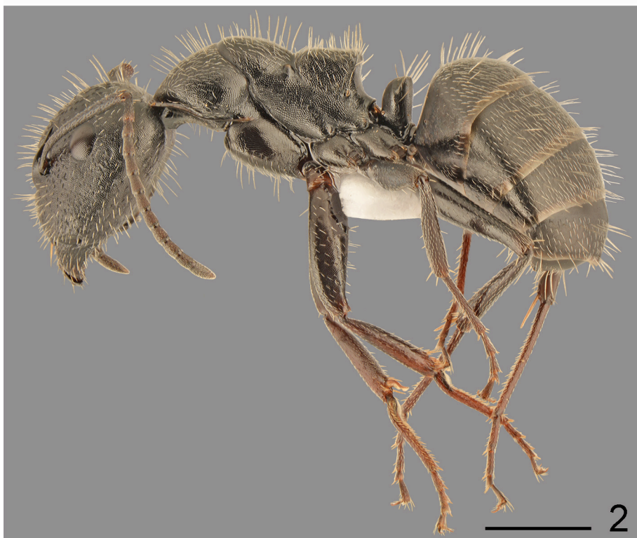
1, 2. Camponotus nitidescens FOREL, minor worker: 1 – dorsal, 2 – lateral (scale bar 1 mm)