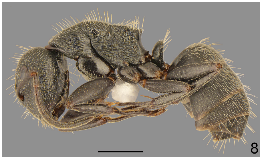
7, 8. Camponotus boghossiani FOREL, major worker (specimen from Samos): 1 – dorsal, 2 – lateral (scale bar 1 mm)