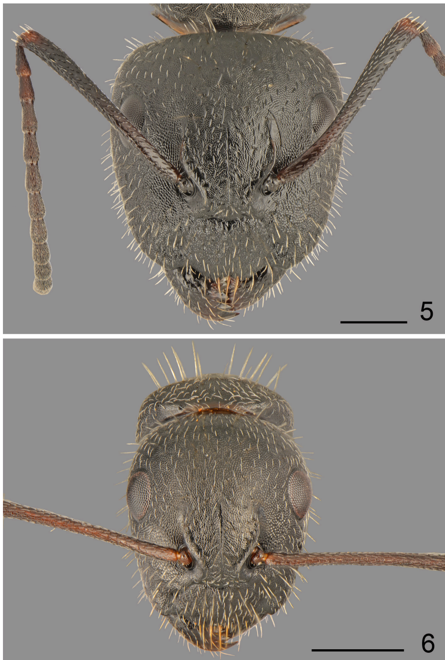
5, 6. Camponotus nitidescens FOREL, head: 5 – major worker, 6 – minor worker (scale bar 0.5 mm)