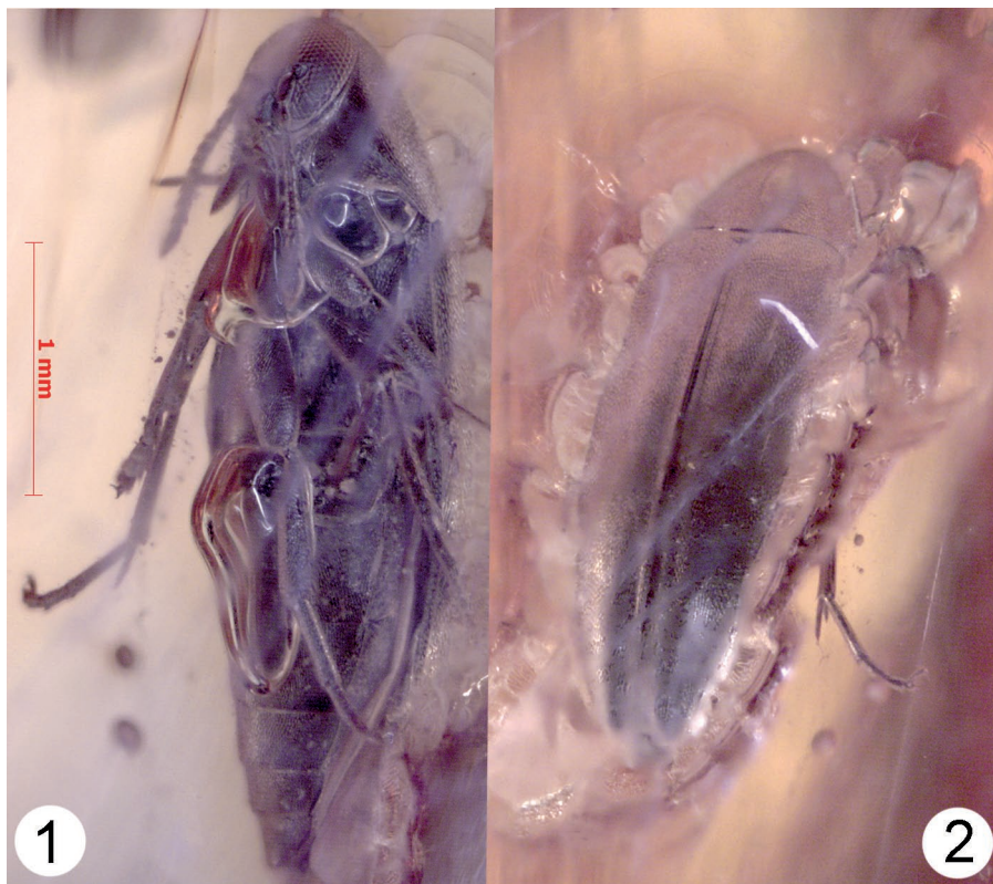
1, 2. Orchesia turkini sp. nov.: 1 – ventral view, 2 – latero-dorsal view

The new species is most similar to the recent O. (Orchestera) luteipalpis Mulsant et Guillebeau, 1857 but differs from it in possessing longer metatibial spurs (in O. luteipalpis they are 1.33-1.40 times shorter than the first metatarsomere).